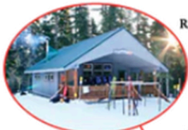
RAY GAREY CABIN