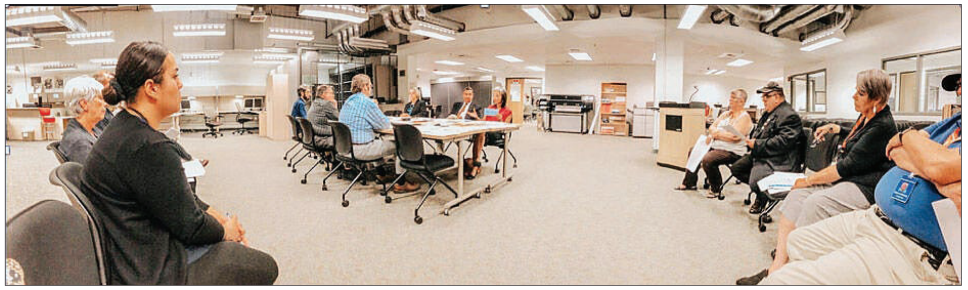
Political party observers in Pierce County watch a meeting of the canvassing board during a recent election.