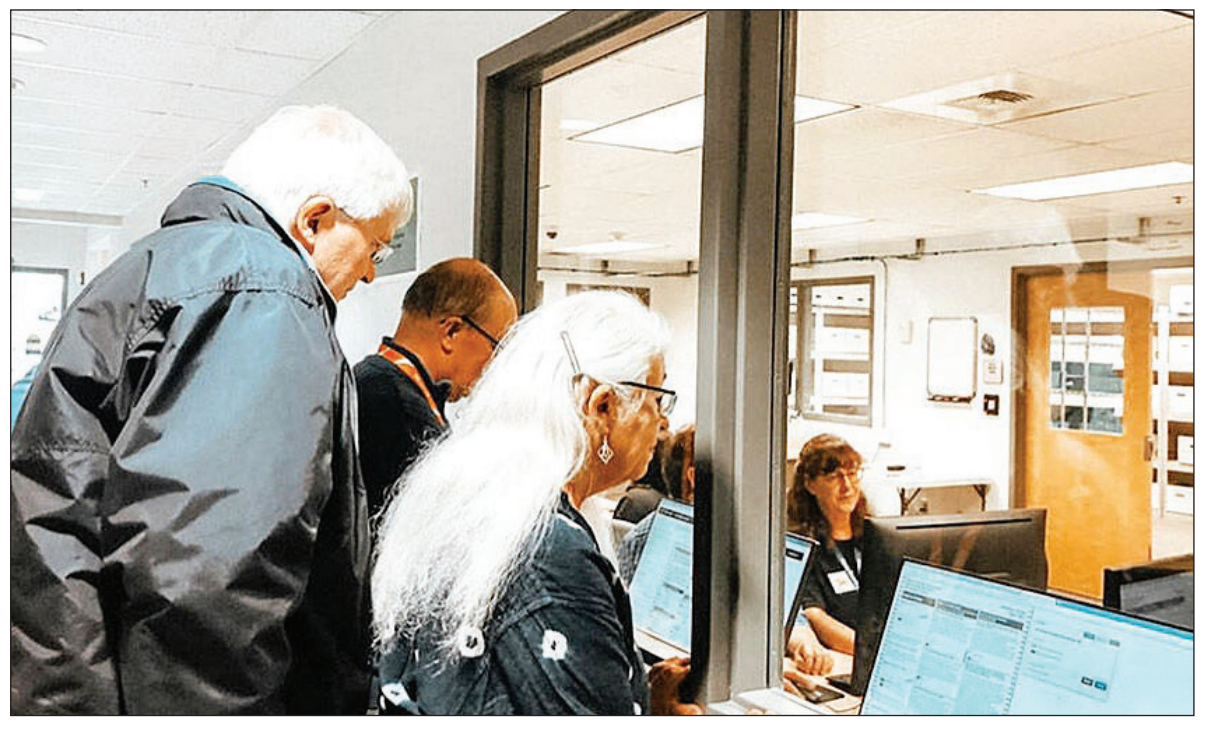
The Pierce County Auditor's office is large enough to feature a glass-fronted walkway where observers can watch election officials at work.